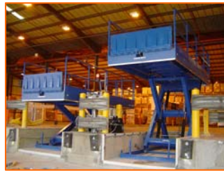
Double Deck Loading Bay Lifts at Superdrug shown during installation at a refurbished warehouse in Croydon