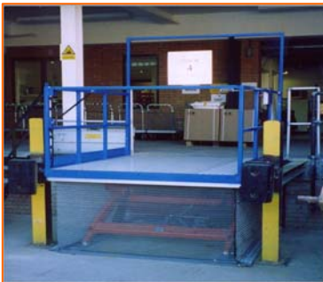
Against a Dock

Most sites can accommodate a LOADING BAY LIFT TABLE fitted against an existing dock, within a dock or as a free standing opening yard lift. Lifts can be floor mounted or fitted within a flush pit.