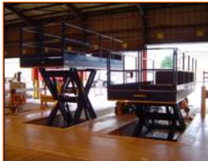
Within a Dock